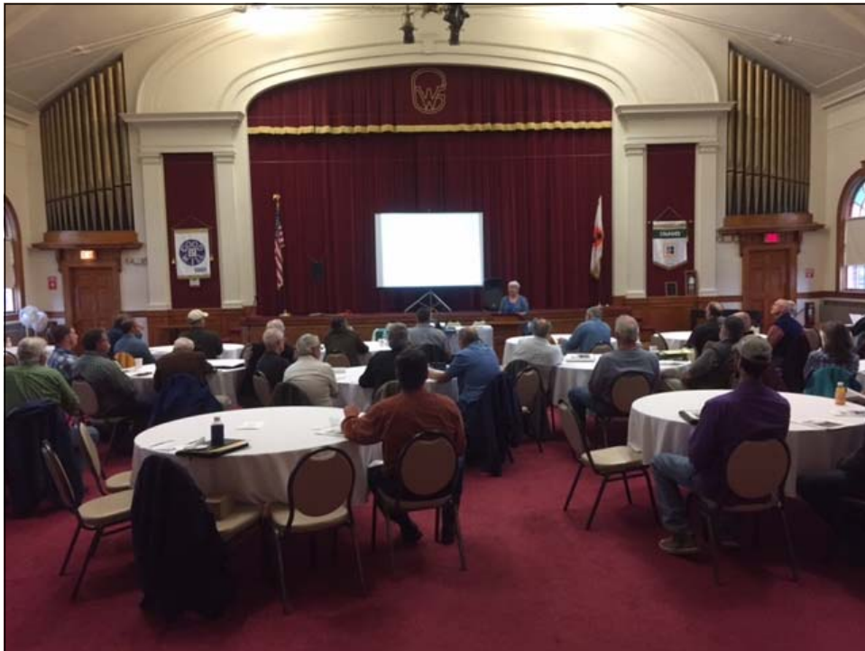
Presentation at the 2016 MSLS Fall Meeting at Good Will-Hinckley School, Fairfield

“ The Parting Shot ” appears in place of where mailing information is located on postal mailed copies and is a little extra something for email recipients. Email your interesting surveying or Maine “Parting Shot” to editor@msls.org !